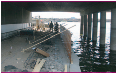
Broad Street Pedestrian Underpass