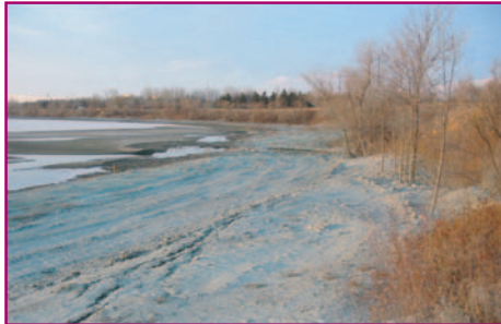
Toe Berm after Hydroseeding

affected by the lake excavation project. 1.4million m3 of excavated fill was placed, graded and seeded to enlarge and enhance Wascana Hill, to create stabilization toe berms, create