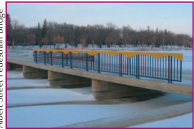
Albert Street Pedestrian Bridge