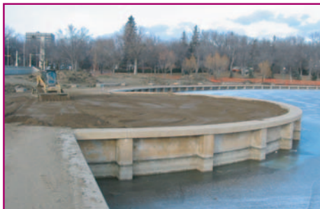
Albert Street Promenade Viewpoint

Discovery Island, develop the Broad Street pedestrian underpass, create Pine Island from an abandoned bridge abutment, expand Spruce and Willow Islands, and develop the Albert Street Promenade. Crosby Hanna worked closely with the engineering team to design new shorelines, guardrails, a major boardwalk, bridges and viewpoints.