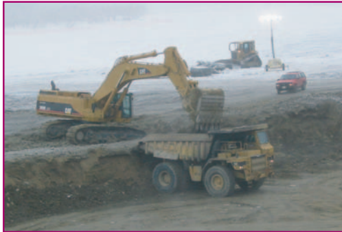
24 Hour Lake Excavation