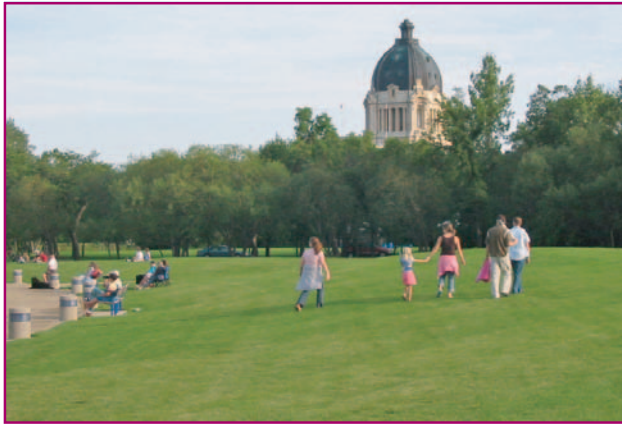
Albert Street Lawn