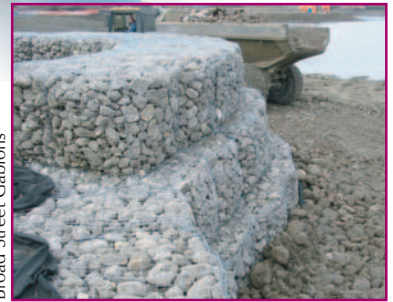
Broad Street Gabions

Discovery Island, develop the Broad Street pedestrian underpass, create Pine Island from an abandoned bridge abutment, expand Spruce and Willow Islands, and develop the Albert Street Promenade. Crosby Hanna worked closely with the engineering team to design new shorelines, guardrails, a major boardwalk, bridges and viewpoints.