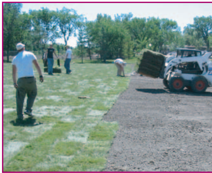
Broad Street Lawn