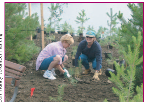
Community Volunteer Planting