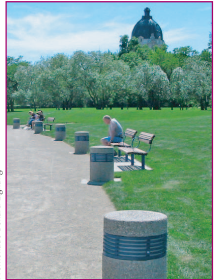
Promenade Bollard Lighting