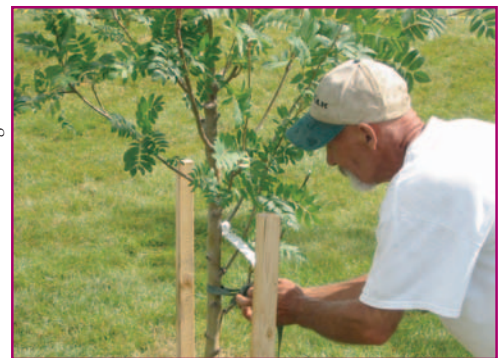
Phase 1 Broad Street Planting