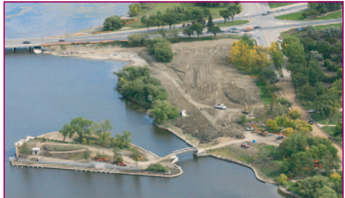
Pine Island / Broad Street Development