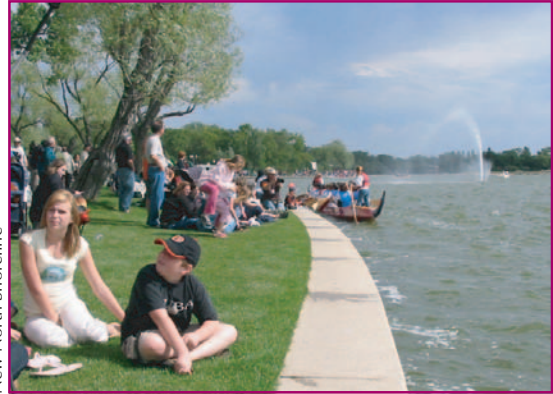
New North Shoreline

Principle features of the Albert Street Promenade included a major walkway linking the north and south shores, lighting & site furniture, secondary pathway connections and irrigated lawns. The promenade