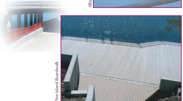
Pine Island Boardwalk