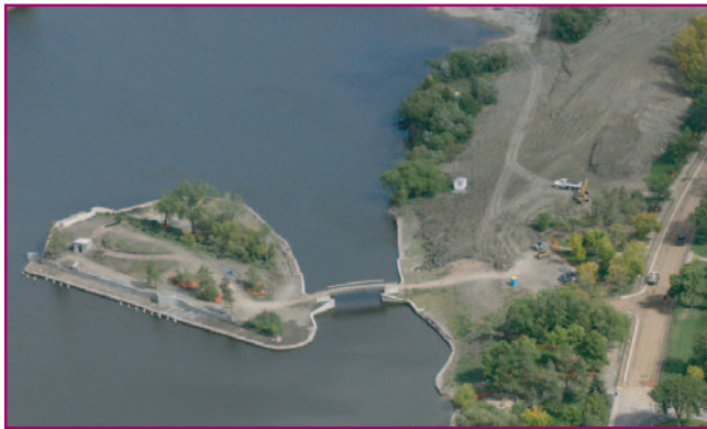
Pine Island / Broad Street Development

Landscape development in the Broad Street area included new grading and pedestrian pathways, including the Broad Street pedestrian underpass. Site furniture and lighting, seeding, sod and irrigation as well as the first phase of a long term planting program were included in the work. A derelict parking lot was reconstructed and other infrastructure improvements were done.