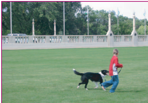
Albert Street Lawn adjacent Historic Bridge

includes 3 viewpoints and multi-purpose gathering places as well as a major interpretive installation. The interpretive content, designed and produced by Wascana, required close coordination between the design team and Wascana. Carefully considered grading ensured that the visual integrity of the historic Albert Street Bridge was maintained.