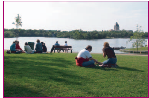
Broad Street Lawn Area

Landscape development in the Broad Street area included new grading and pedestrian pathways, including the Broad Street pedestrian underpass. Site furniture and lighting, seeding, sod and irrigation as well as the first phase of a long term planting program were included in the work. A derelict parking lot was reconstructed and other infrastructure improvements were done.