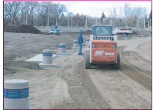
Promenade Lighting & Pathway

Crosby Hanna lead a multi-disciplinary team to design landscape improvements in Wascana Centre resulting from the Wascana Lake Revitalization Project. Key features included the Albert Street Promenade, Pine Island Development and related landscape development in the Broad Street area. Long term development plans were prepared for each area and priority elements were designed for implementation in accordance with available funding.