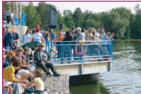
Pine Island Boardwalk

Pine Island was created from an abandoned bridge abutment. The island's principal function is to provide a finish line venue for competitive rowing, canoe and kayak events, while providing recreational amenities for daily use. Key features include a permanent Judge's Stand, a large boardwalk and hillside viewing lawn to accommodate spectators, a water screen with pedestrian access beneath, pathways, site furniture and lighting, lawns and extensive planting areas dominated by Pine species.