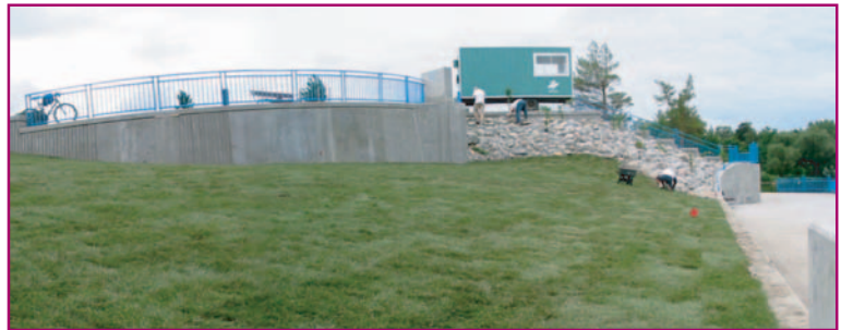
Pine Island Wall & Judges' Stand