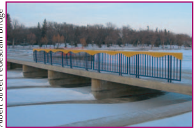
Albert Street Pedestrian Bridge