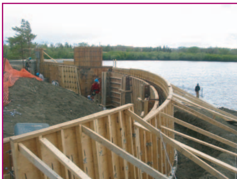
Pine Island Retaining Wall