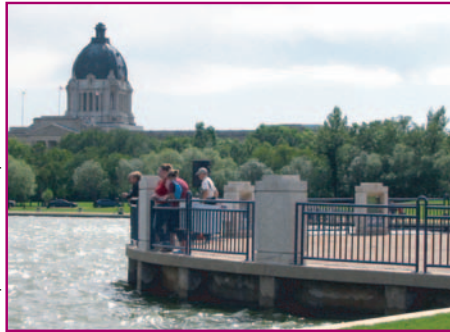
Viewpoint with Interpretive Installation

Principle features of the Albert Street Promenade included a major walkway linking the north and south shores, lighting & site furniture, secondary pathway connections and irrigated lawns. The promenade