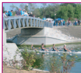
Pine Island Access