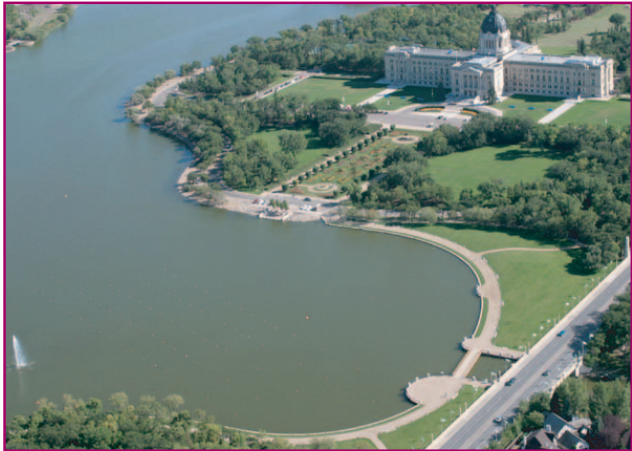
Albert Street Promenade