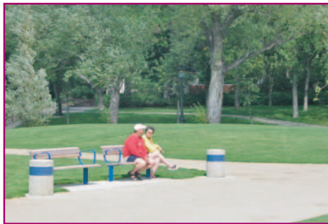
Promenade Site Furniture

includes 3 viewpoints and multi-purpose gathering places as well as a major interpretive installation. The interpretive content, designed and produced by Wascana, required close coordination between the design team and Wascana. Carefully considered grading ensured that the visual integrity of the historic Albert Street Bridge was maintained.